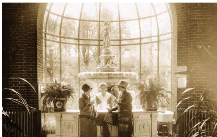
Spring Room in the 1920s