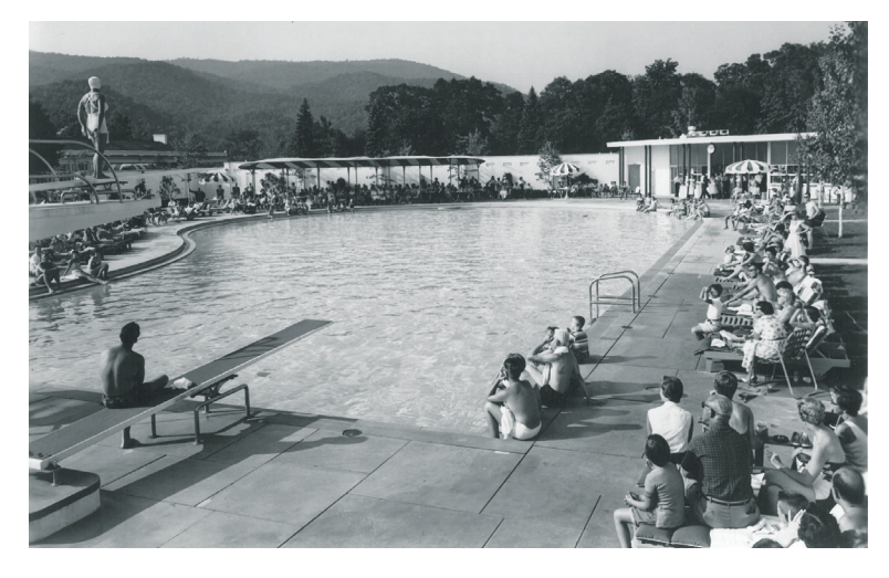
The Outdoor Pool - circa 1950s

Tree Tops Café features a covered dining area with a full food and bar menu, and tenting can be added to accommodate private parties of up to 150 guests. The pool opens in early May and closes in mid-October.