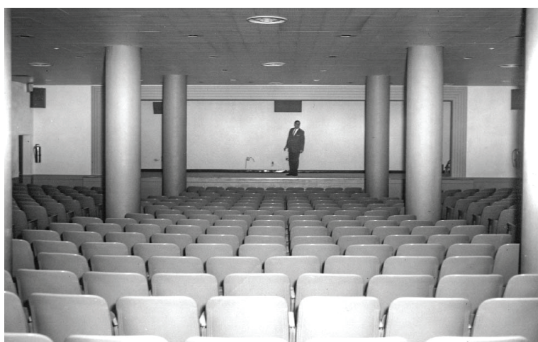
Governor's Hall - March, 1960