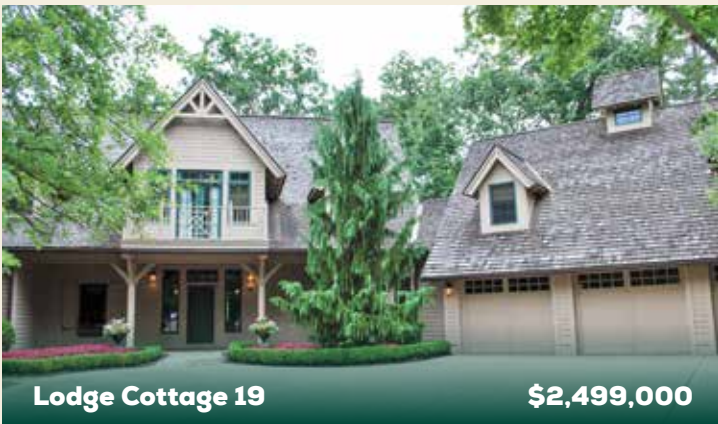
Lodge Cottage 19