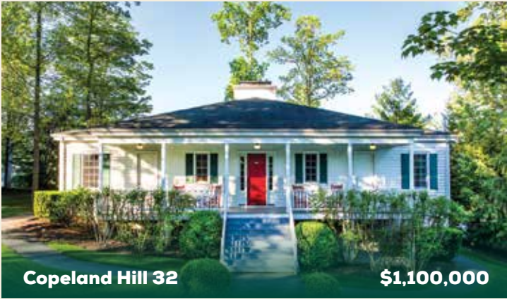
Copeland Hill 32