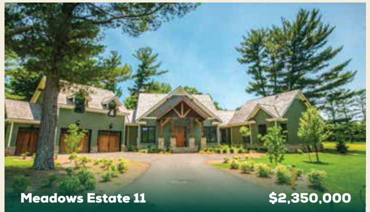
Meadows Estate 11