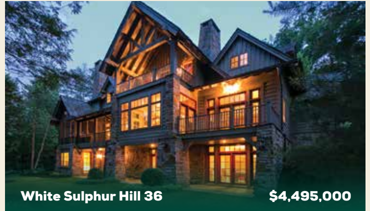
White Sulphur Hill 36