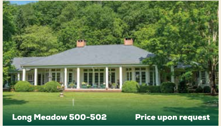
Long Meadow 500-502