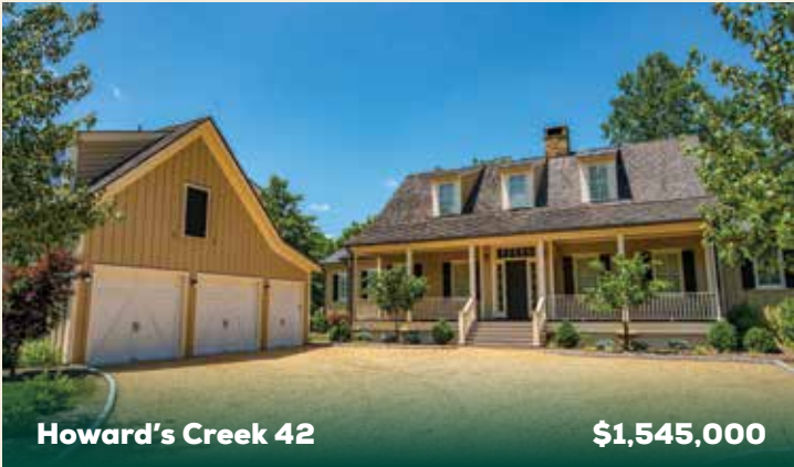
Howard's Creek 42