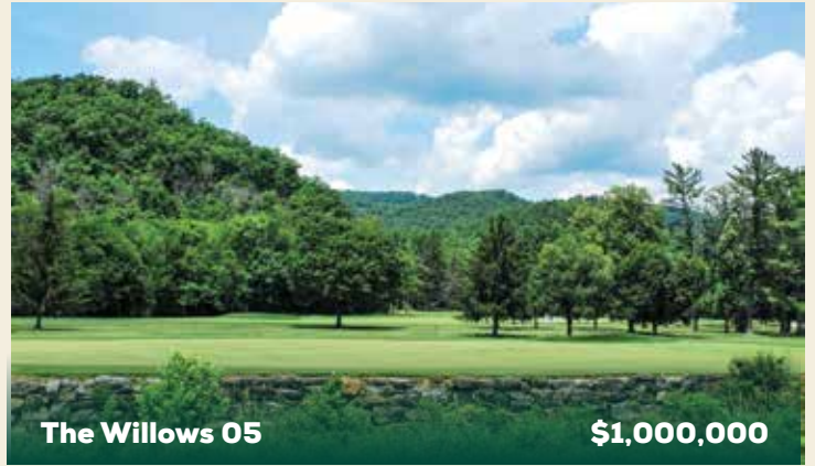
The Willows 05