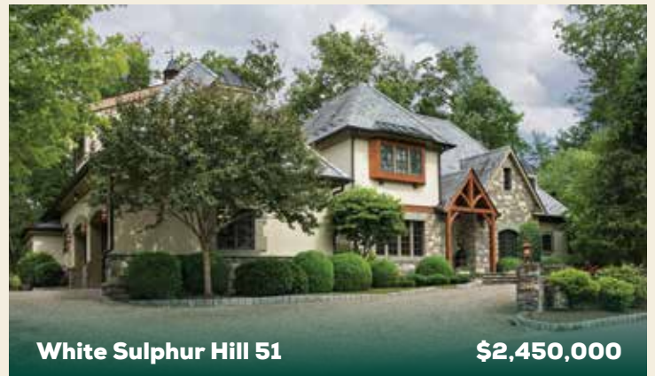
White Sulphur Hill 51