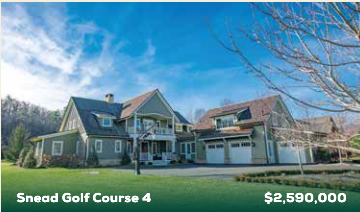
Snead Golf Course 4