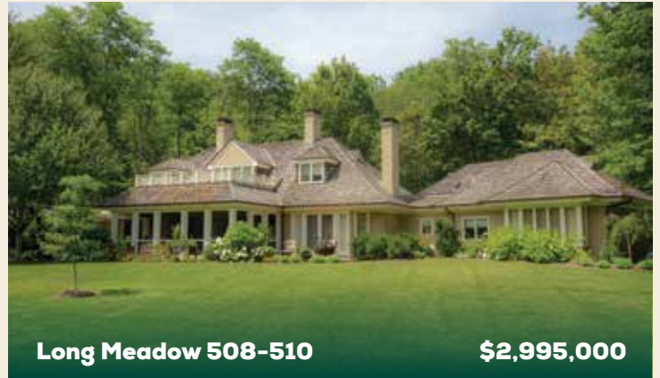
Long Meadow 508-510