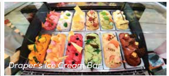
Draper's Ice Cream Bar