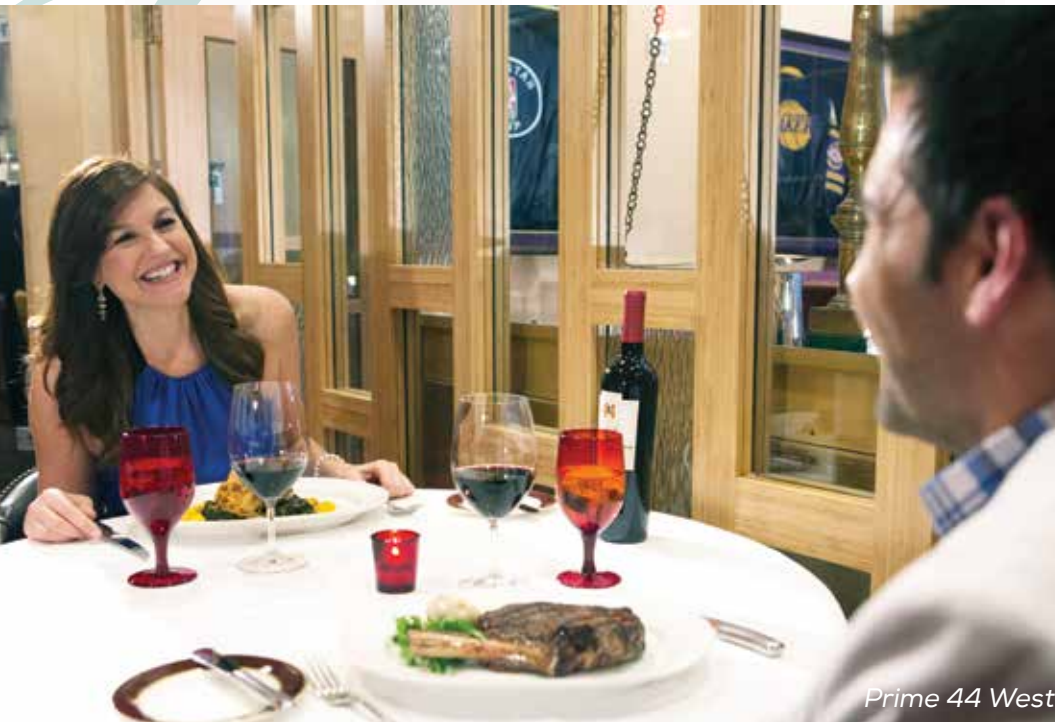
Prime 44 West