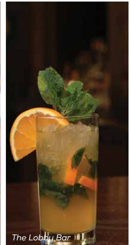
The Lobby Bar