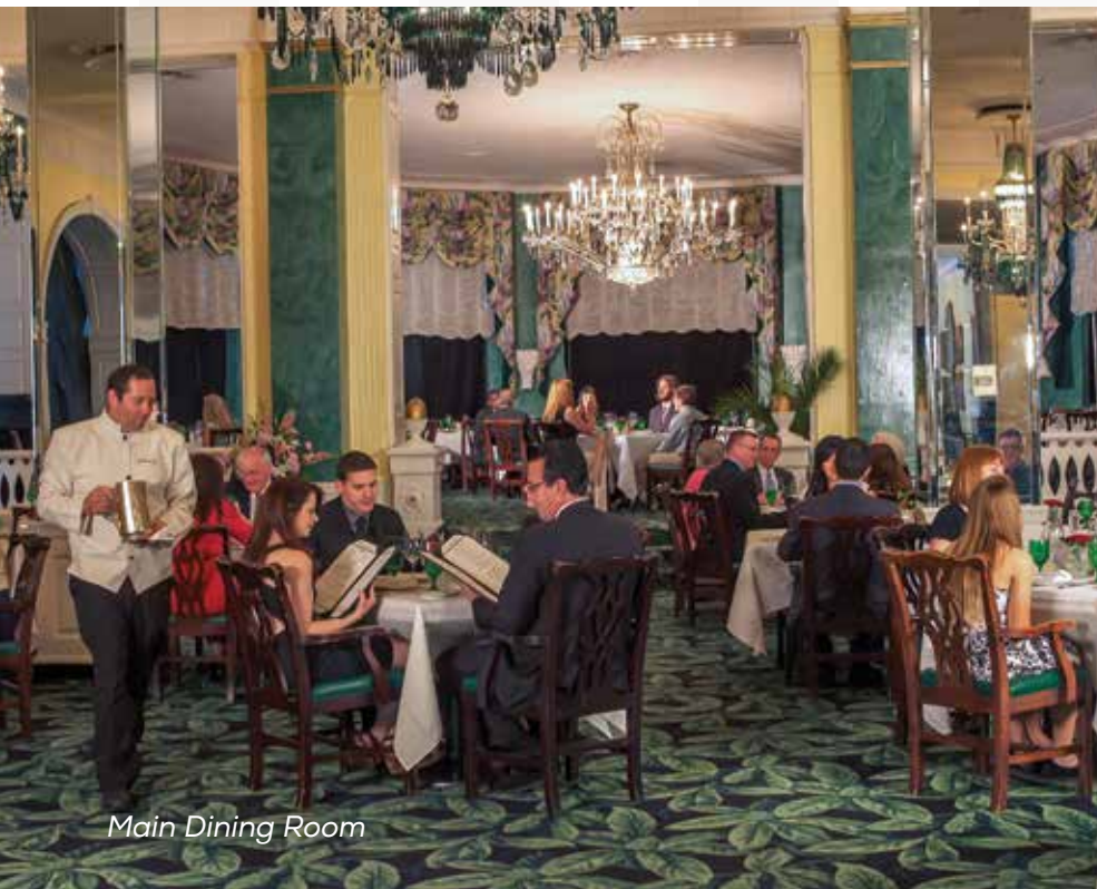
Main Dining Room