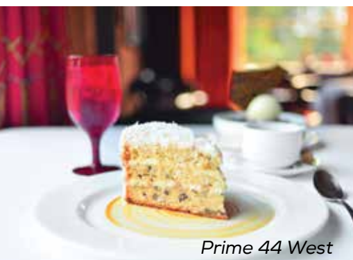
Prime 44 West