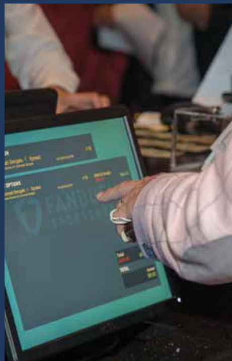
The first bets being placed at the Grand Opening ceremony.