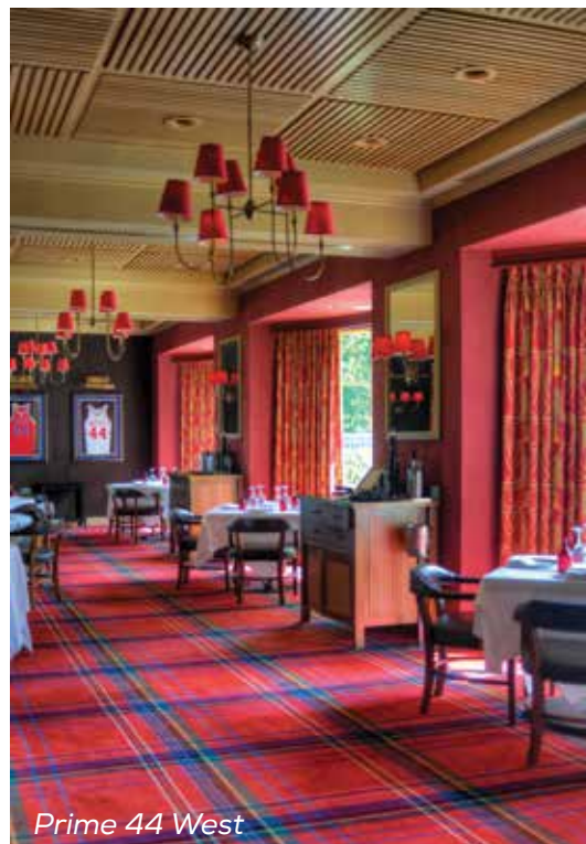
Prime 44 West