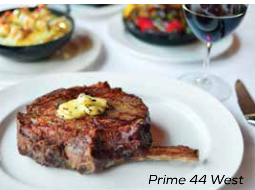
Prime 44 West