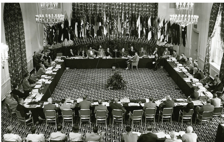
Governor's Conference - Crystal Room circa 1950